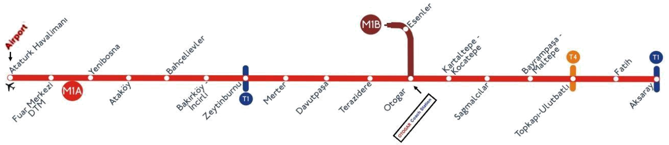
Route to Coach Station from Airport (Coach Station = Otogar)

On diagram you can see the route of subway. Now, you are at Airport. Tenth station is the coach station. You'll get off there.